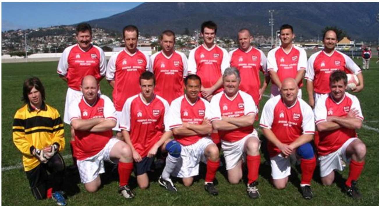
2007 Division 3 Team featuring the Blizzards