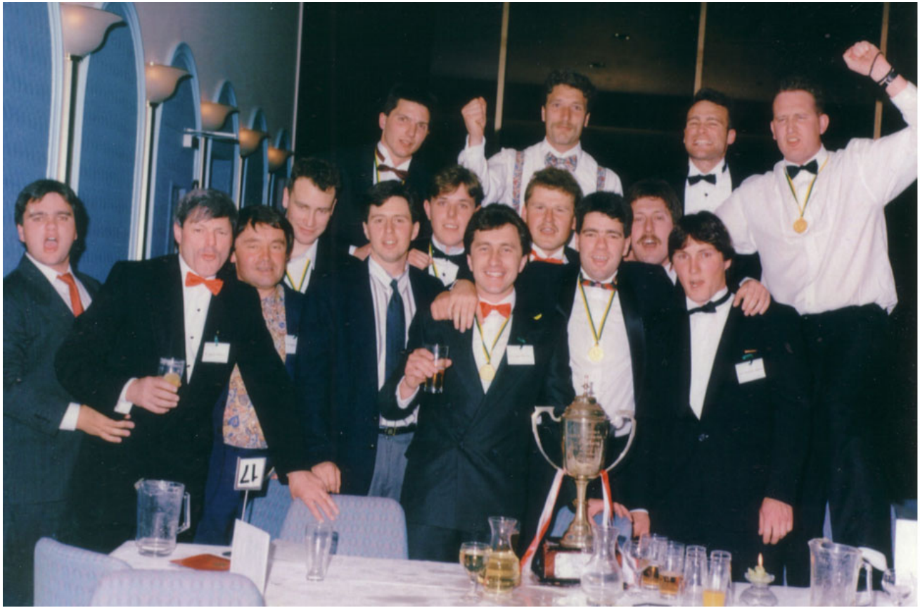
1991 Premiership Celebrations featuring the Stoddart and Morrison families