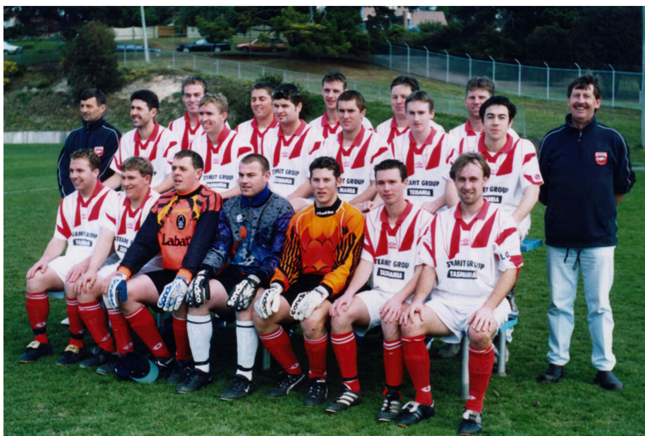
2001 Senior Squad featuring the Savage, Murray and Jones families