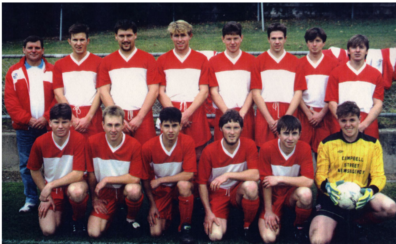
1992 Premier Reserves side featuring the Murray family