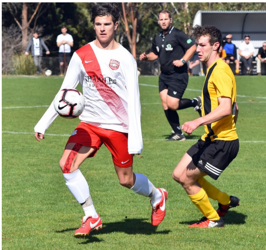
Samuel Leszczynski v University