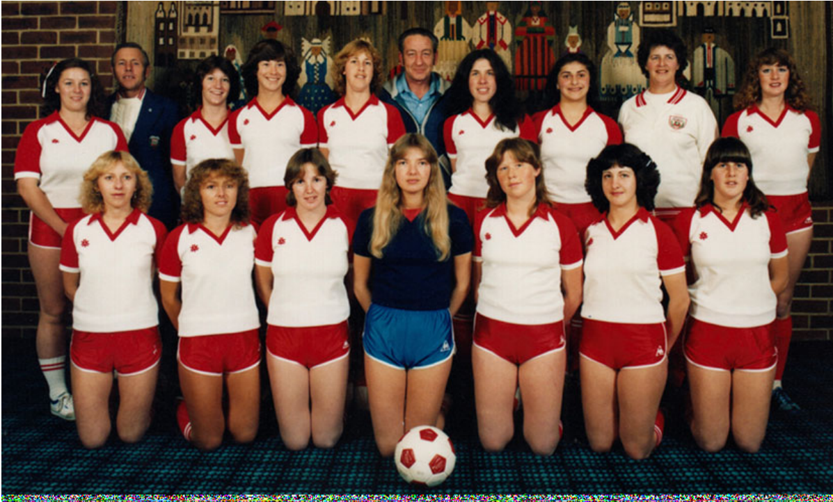
1981 Division 1 Premiers featuring members of the Steenhuis and Rosinski families