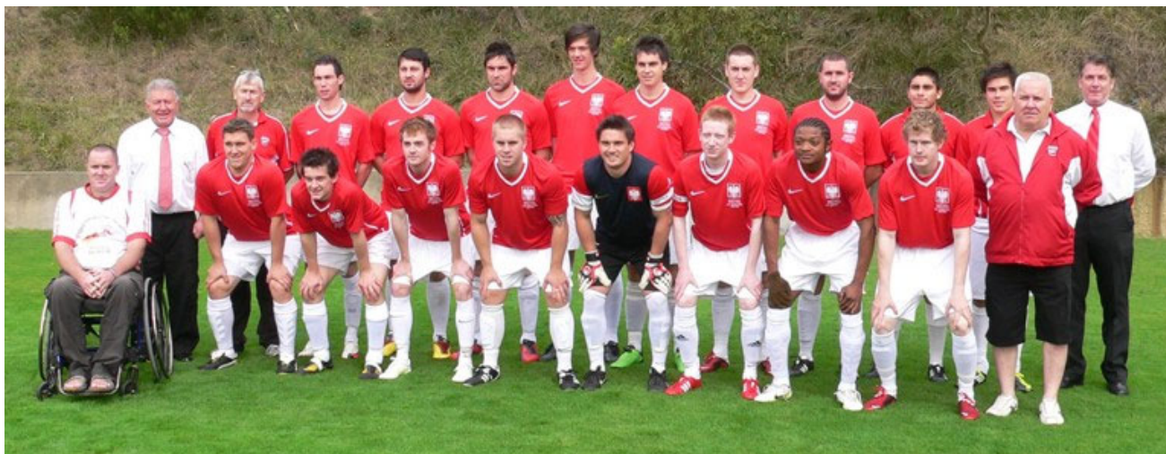
New Town Eagles Line-up v Juventus – 9th April 2011

"The first half, I thought, was really good. We created a lot of chances. Really, we should have put them away in the first half. "If you don't score goals and take your opportunities, then the game becomes harder, which it did. "They scored on the break, and we were 1-0 down. The second half was much better in that we scored a few nice goals. "Yeah, the boys worked hard. I mean, there were a few positional errors, and they caught us right at the end. A bit disappointing, but one point is better than none. We'll keep going on from here."