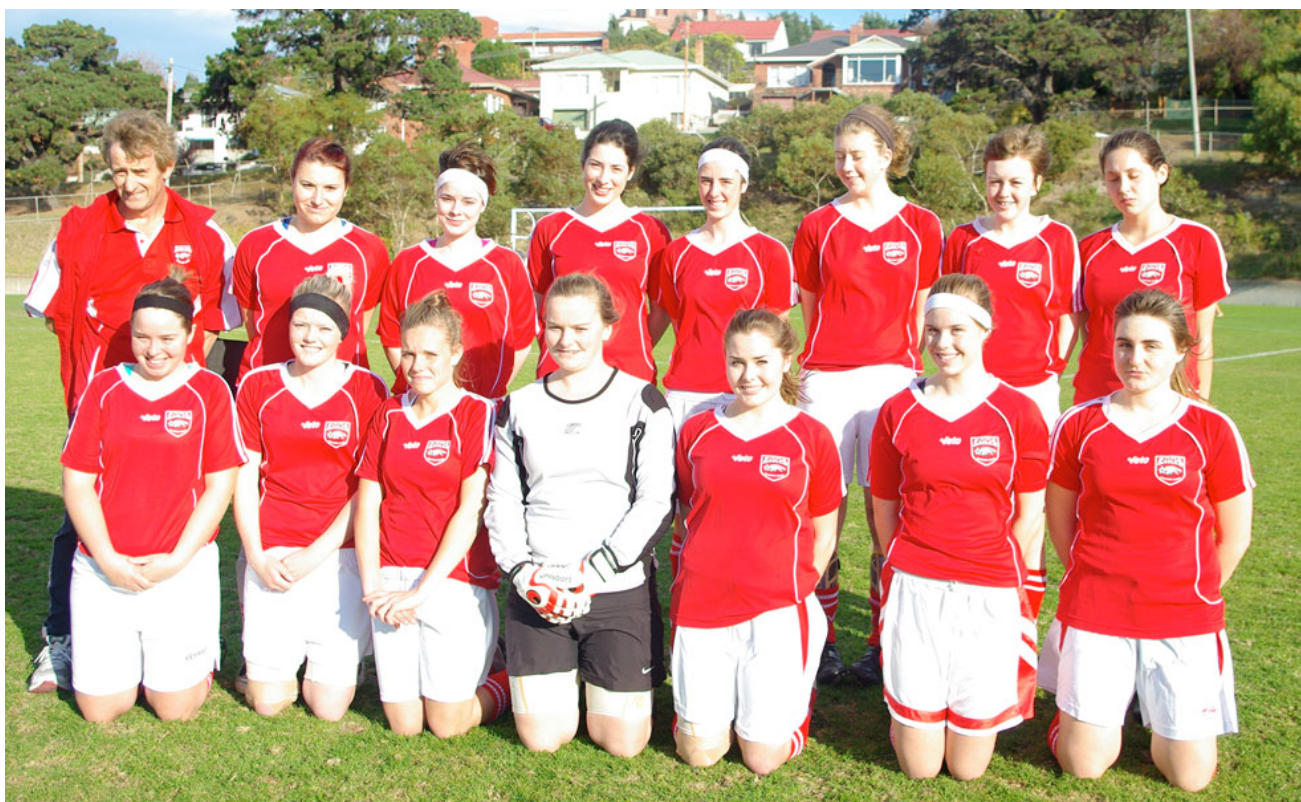
Women's Division 1 2011