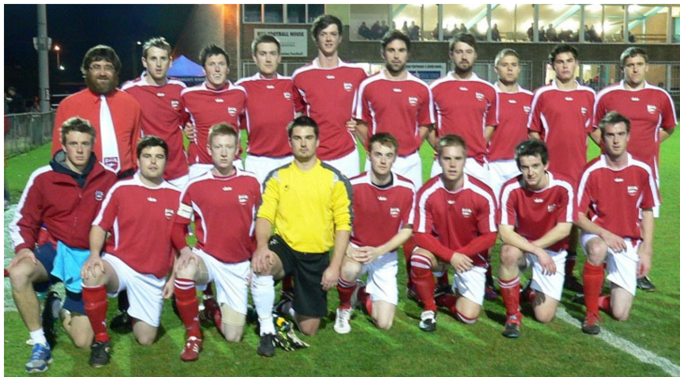
2012 Laskoseljac Cup Final Team