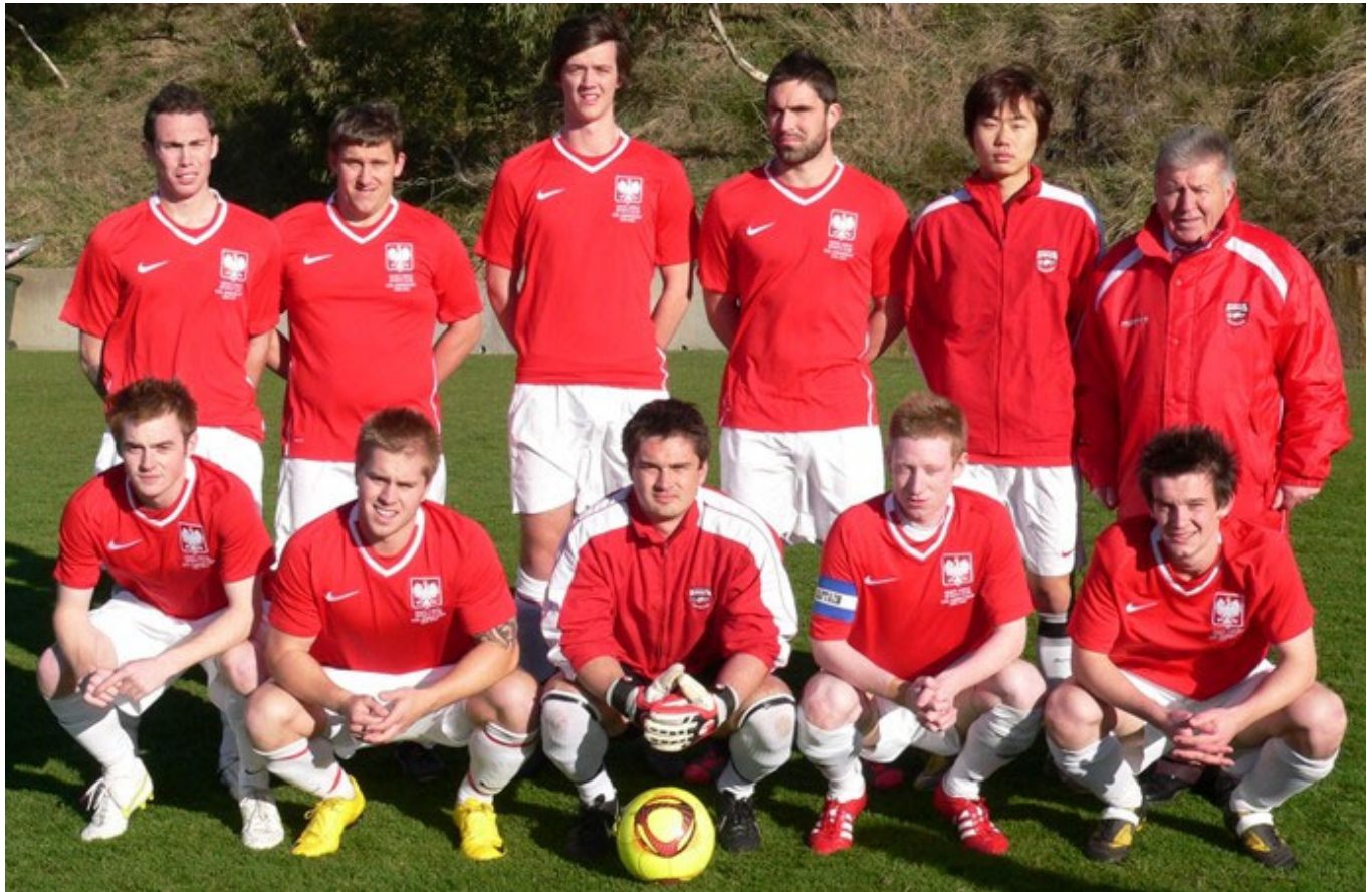
2011 Senior Team