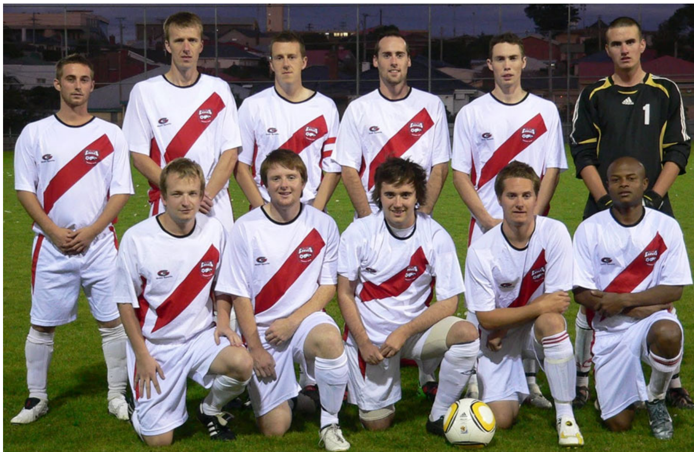
2010 Reserves Team