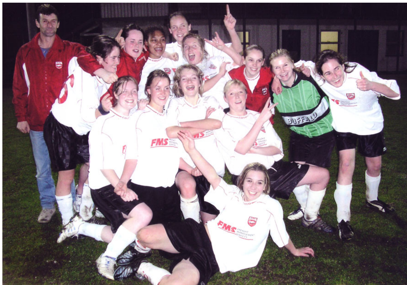
2005 Premier League Women – Premiers & Summer Cup Winners