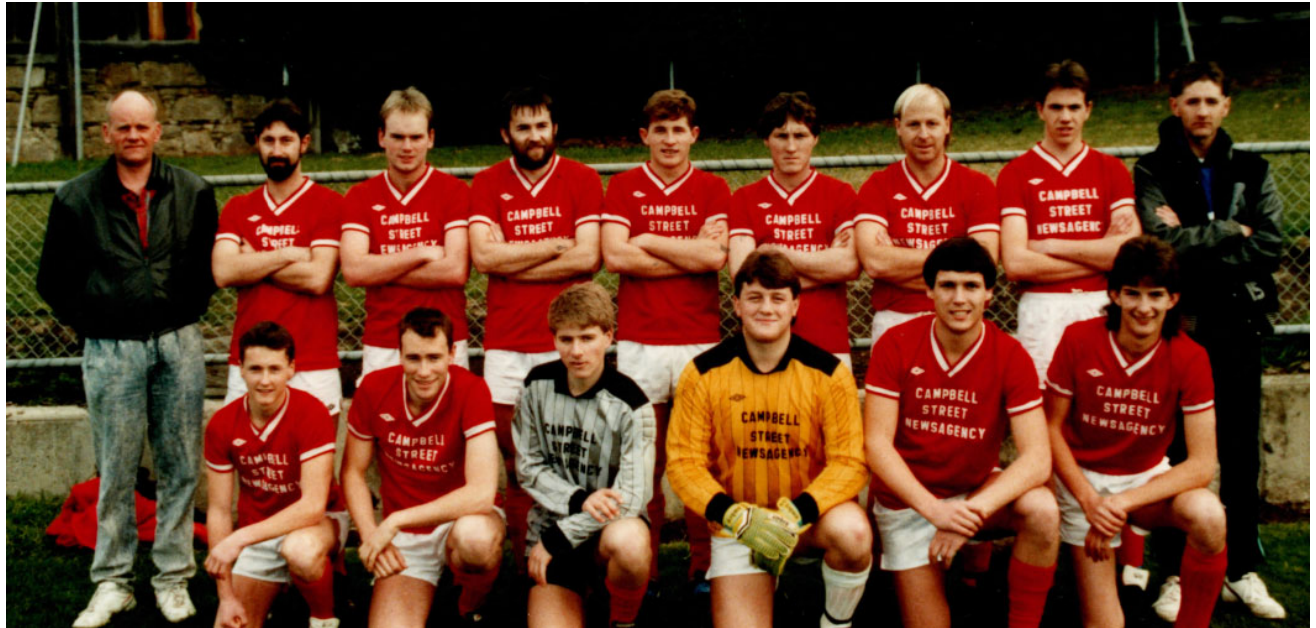
Rothmans League Division 1 Premiership Team - 1989