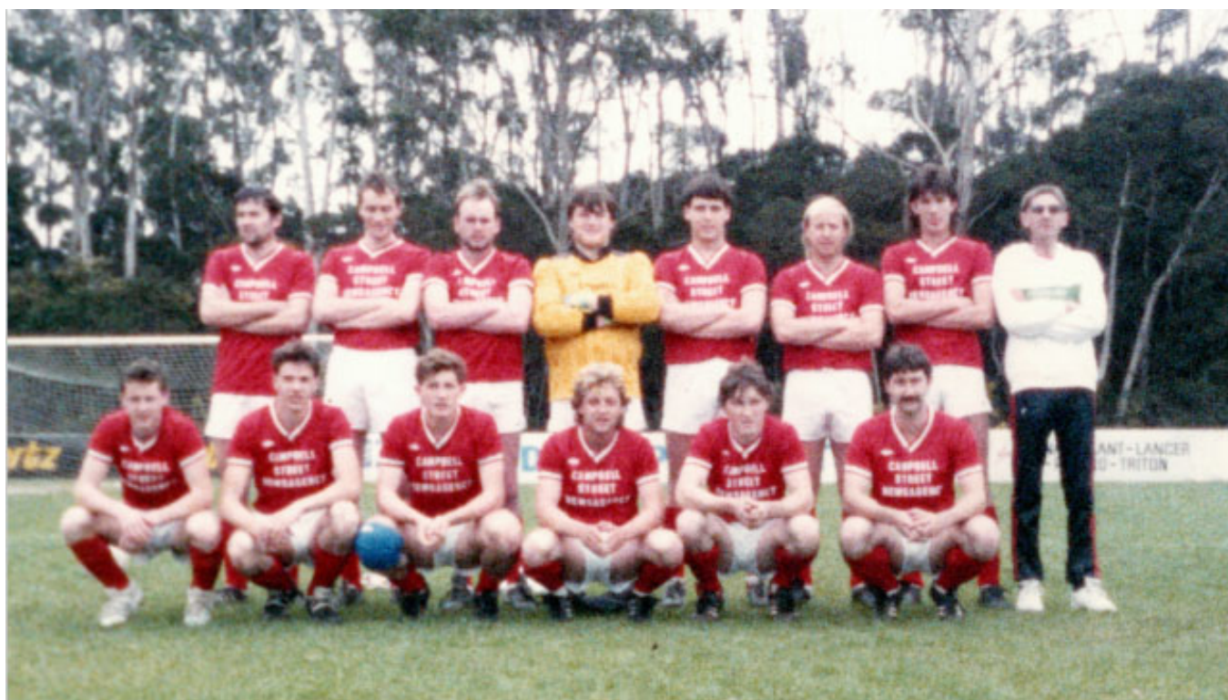
Rothmans League Division 1 State Championship Squad v Devonport Valley Road – 1989

White Eagles headed in a corner to reduce the leeway to a single goal and the Southern side sensed victory. A substitution proved a match-winning move, as the substitute entered the fray to smash home two quick goals, the second of which was scored with just two minutes remaining.