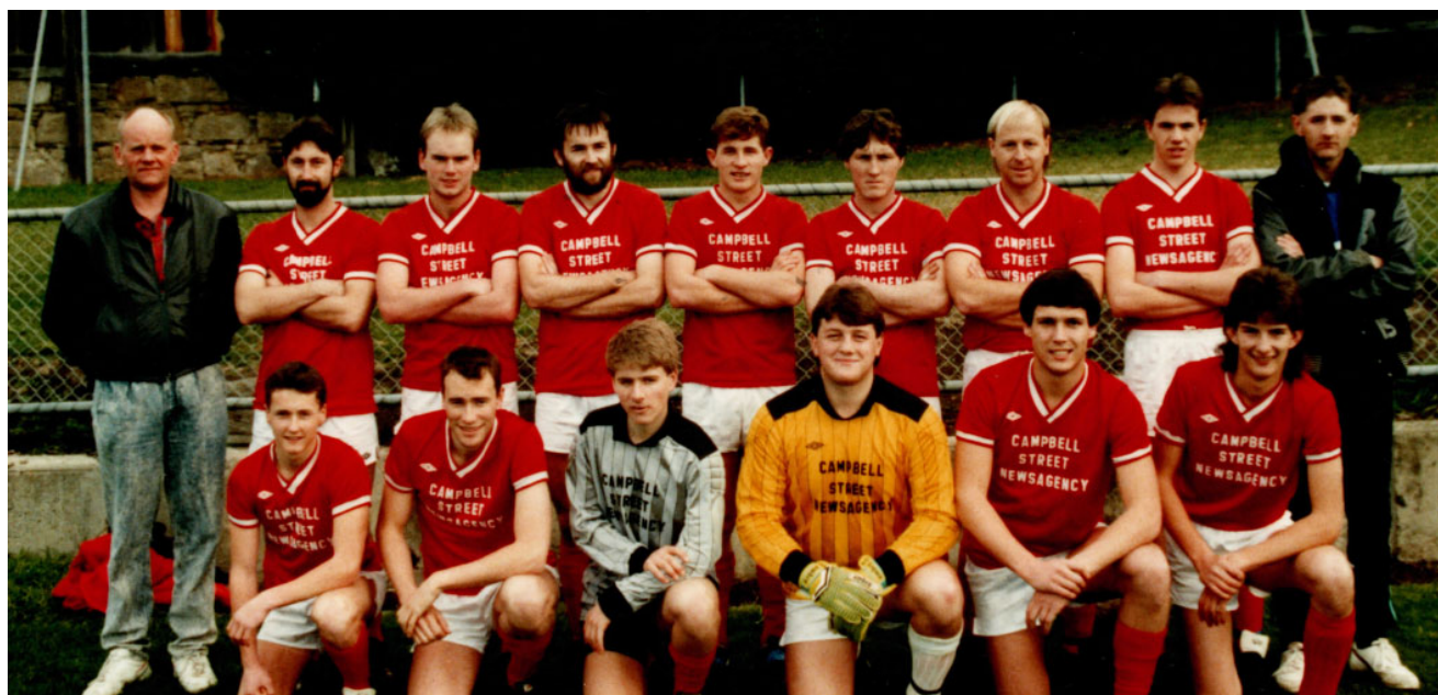
Rothmans League Division 1 Premiership Team - 1989