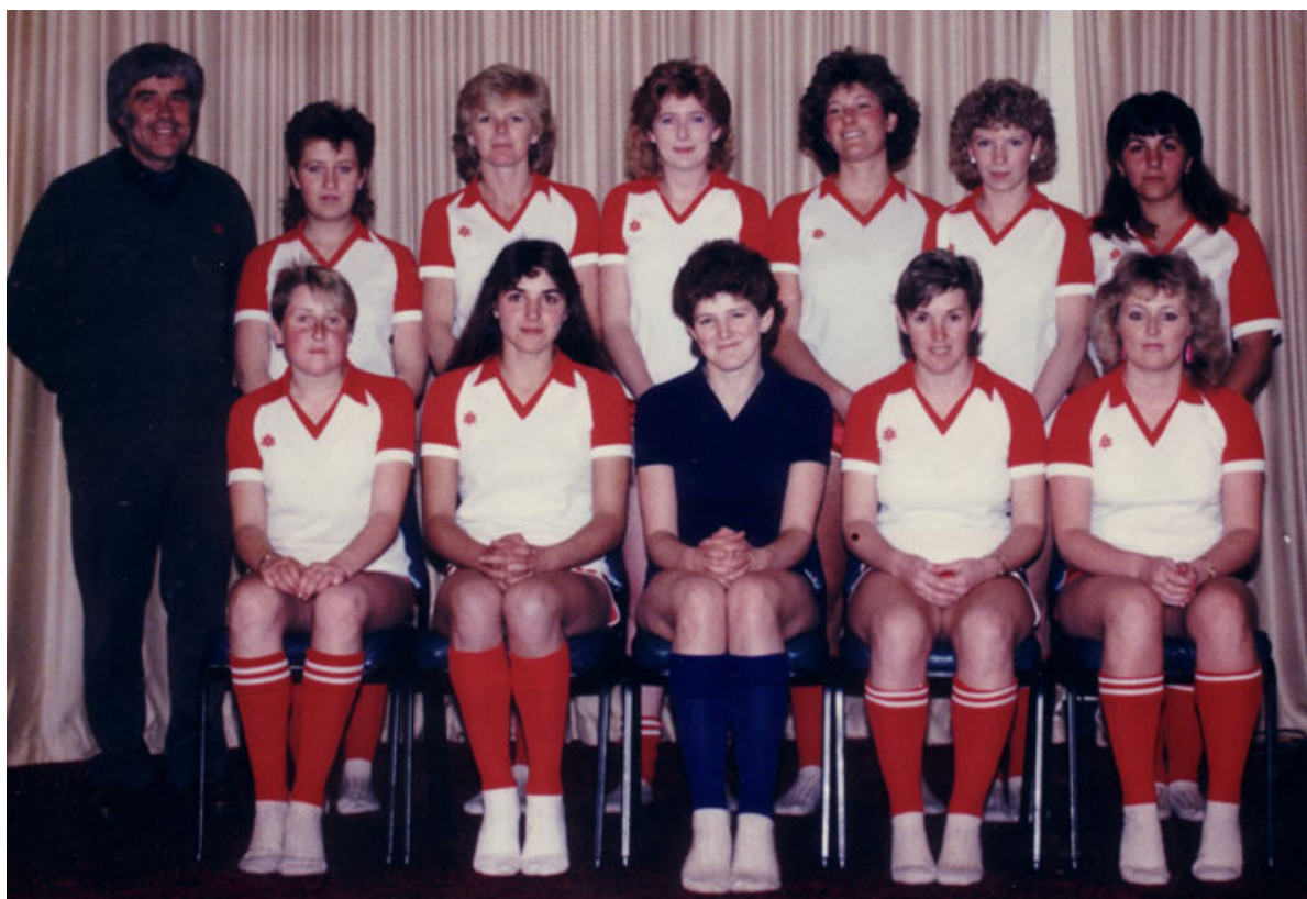
1986 Women's Teams