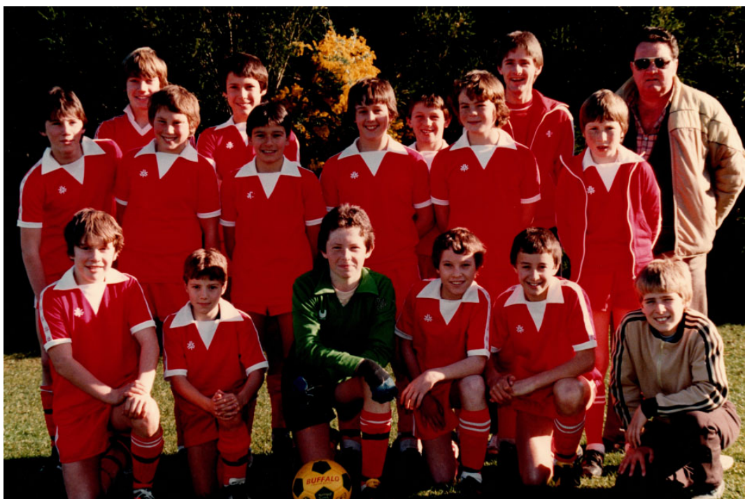
Under 13's Premiers 1984