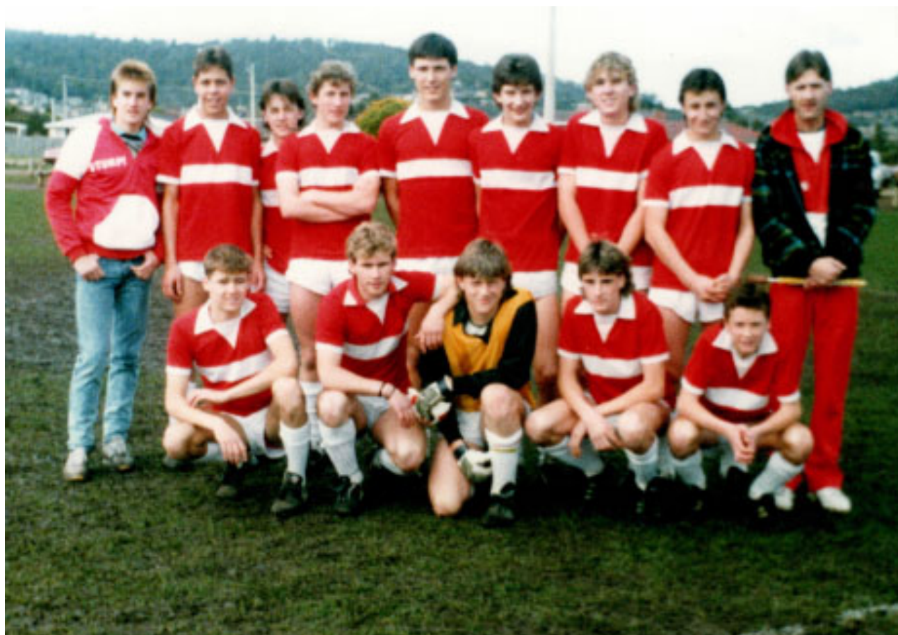
1987 Under 16 Red Premiers